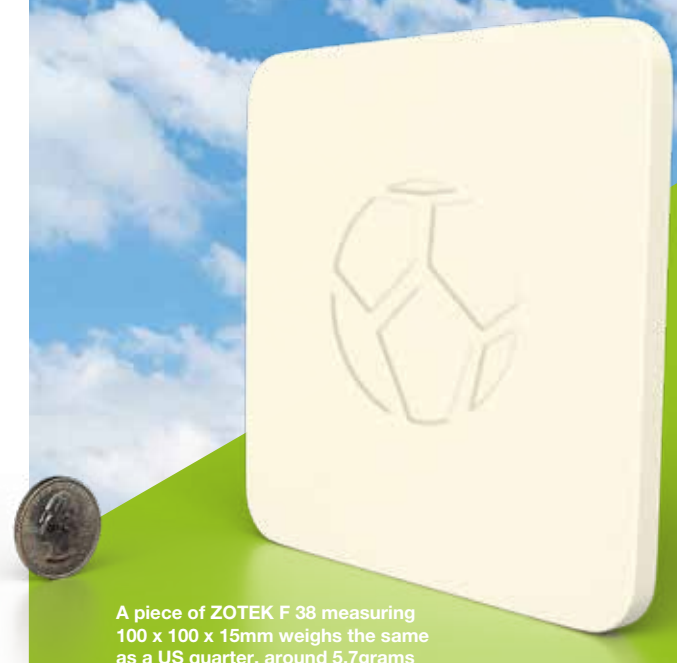
A piece of ZOTEK F 38 measuring 100 x 100 x 15mm weighs the same as a US quarter, around 5.7grams

"A natural and logical step towards helping society reduce energy consumption"